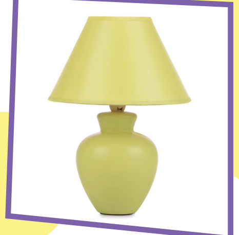
© 2021 Lifeway Explore the Bible: Preschool Activity Pages