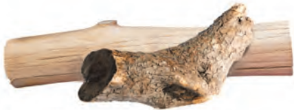
Cedar logs and olive wood