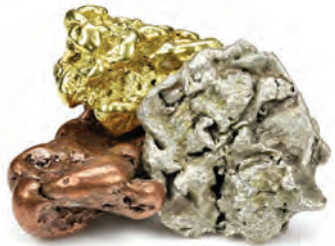
Metals (gold, silver, bronze, iron)